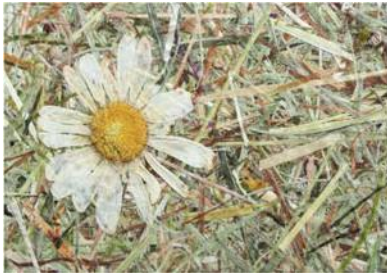
WILDSPITZE MARGERITTA * ALPINE HAY FROM 1,700 M ABOVE SEA LEVEL AT THE FOOT OF THE WILDSPITZE - WITH GENUINE DAISY FLOWER HEADS