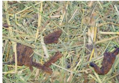
WILDSPITZE WANILLÄ * ALPINE HAY FROM 1,700 M ABOVE SEA LEVEL AT THE FOOT OF THE WILDSPITZE - WITH BOURBON VANILLA PODS