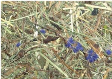
WILDSPITZE LAWENDL * ALPINE HAY FROM 1,700 M ABOVE SEA LEVEL AT THE FOOT OF THE WILDSPITZE - WITH LAVENDER STALKS AND BLOSSOMS