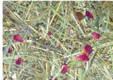
WILDSPITZE ROASA * ALPINE HAY FROM 1,700 M ABOVE SEA LEVEL AT THE FOOT OF THE WILDSPITZE - WITH ROSE PETALS AND BUDS