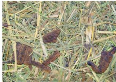
WILDSPITZE WANILLÄ * ALPINE HAY FROM 1,700 M ABOVE SEA LEVEL AT THE FOOT OF THE WILDSPITZE - WITH BOURBON VANILLA PODS