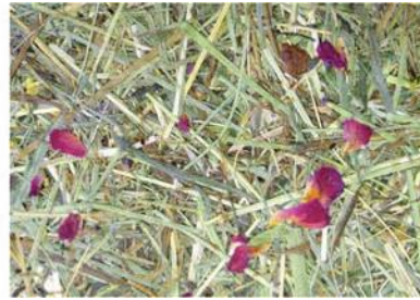
WILDSPITZE ROASA * ALPINE HAY FROM 1,700 M ABOVE SEA LEVEL AT THE FOOT OF THE WILDSPITZE - WITH ROSE PETALS AND BUDS